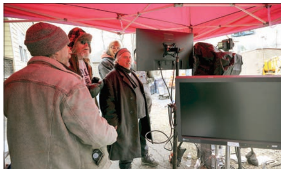
Photographer Gregory Crewdson, center, checks the monitors with key members of his crew as twilight approaches for the creation of one of his famed, painting-like photographs in Pittsfield.

“We’re also booking housing and rental cars,” Overbaugh adds. Getting generators for the set has been a main focus for the day. “We get calls from the set, saying they need this or that; they need a heater for the day. We source it locally. We figure out how to make it work,” Green says. “Nicole is working on the call sheet for tomorrow. She’s putting the plan together for the next day, while I’m often working in the past, figuring out what actually happened on a specific day. Every day it’s a different picture, a dif-